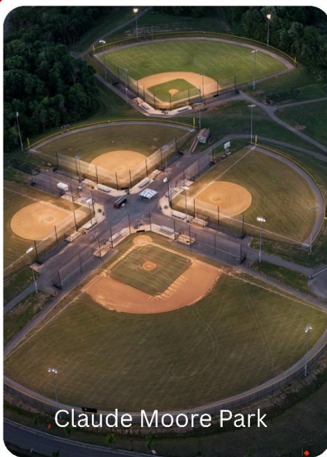
Claude Moore Park